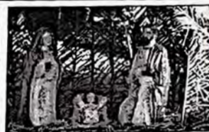
Manger scene in Orange Plaza