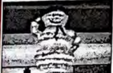
One of the new decorations at the Villa Park shopping center