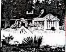
The Liberty family on Wednesday in Villa Park setting up their annual holiday wonderland