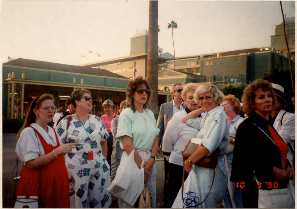
A Day In The Park